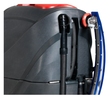
Built in squeegee hanging system for ease of transport in narrow areas