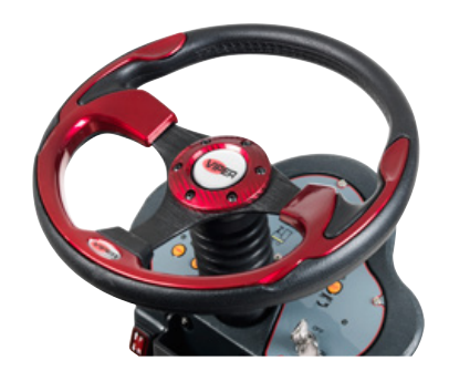
Intuitive dashboard, with single touch buttons for simplicity and ease of use