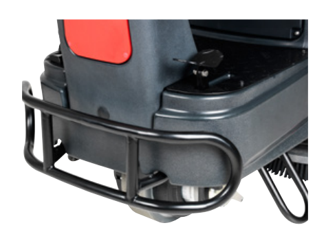
Standard front bumper protects the machine