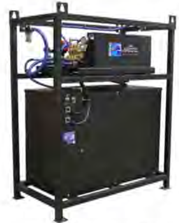
ES650K2496A - 6gpm @ 5000 psi with heavy-duty lifting skid