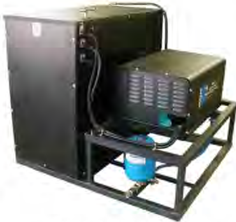
ES830K2472AS - 8 gpm @ 3000 psi with optional SRA surge relief assembly