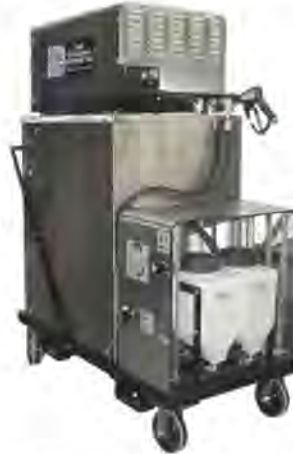
ES543K472AS - 5.4 gpm @ 3000 psi with optional stainless steel wrap, cart and dual chemical system