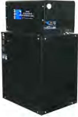
ES543K472A 5.4 gpm @ 3000 psi max.