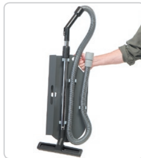
Onboard Scrub-Vac System

14600 21st Avenue North Plymouth, MN 55447-3408 www.advance-us.com Phone 800-850-5559 Fax 800-989-6566