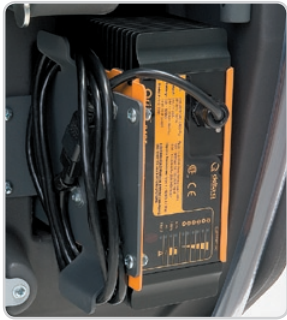
Standard onboard battery charger for wet or gel battery packages.