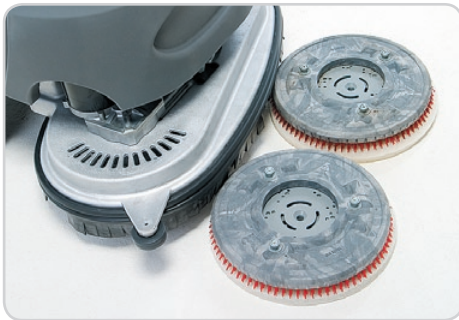
Click-off disc scrub heads for productivity and convenience.