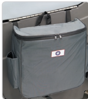
Onboard Tote Bag