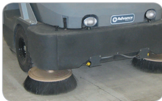
Sweeping with DustGuard™