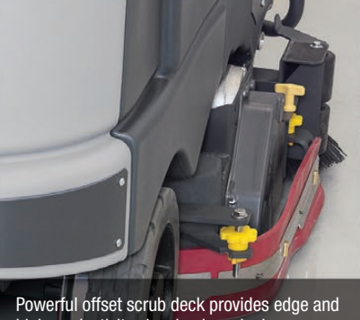
high productivity cleaning in a single pass.