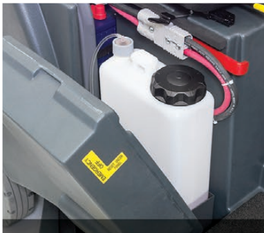
Removable, high capacity detergent cartridge for sustained flexible cleaning is available with optional EcoFlex™ System.