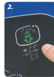
2. EcoFlex™ System Burst of Power button easily increases cleaning performance.