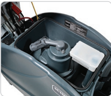
Flip-up lid and tilt-back tank provides easy access to the recovery tank, debris catch cage, batteries and EcoFlex™ cartridge.