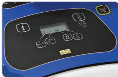
Simple, intuitive controls minimize operator training.