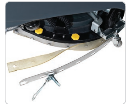
Squeegee wraps around the deck for 100% water pick-up and simply clips onto the bracket with no thumb nuts or adjustment required.