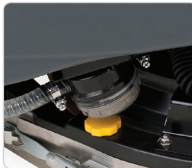
Externally mounted solution filter allows operators to easily clean the filter and manage the solution level.