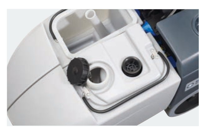
Comfortably and conveniently fill and empty the SC351 with the removable two tank system and rubber protected handles