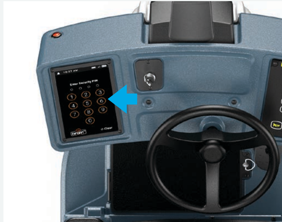
2 Insert the passcode on the touchscreen (1337)