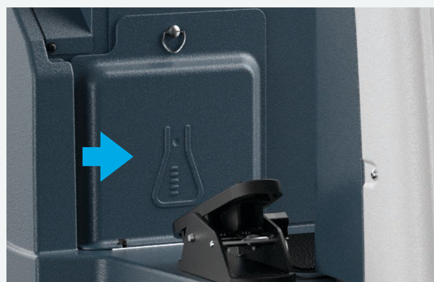
2 Fill the detergent tank