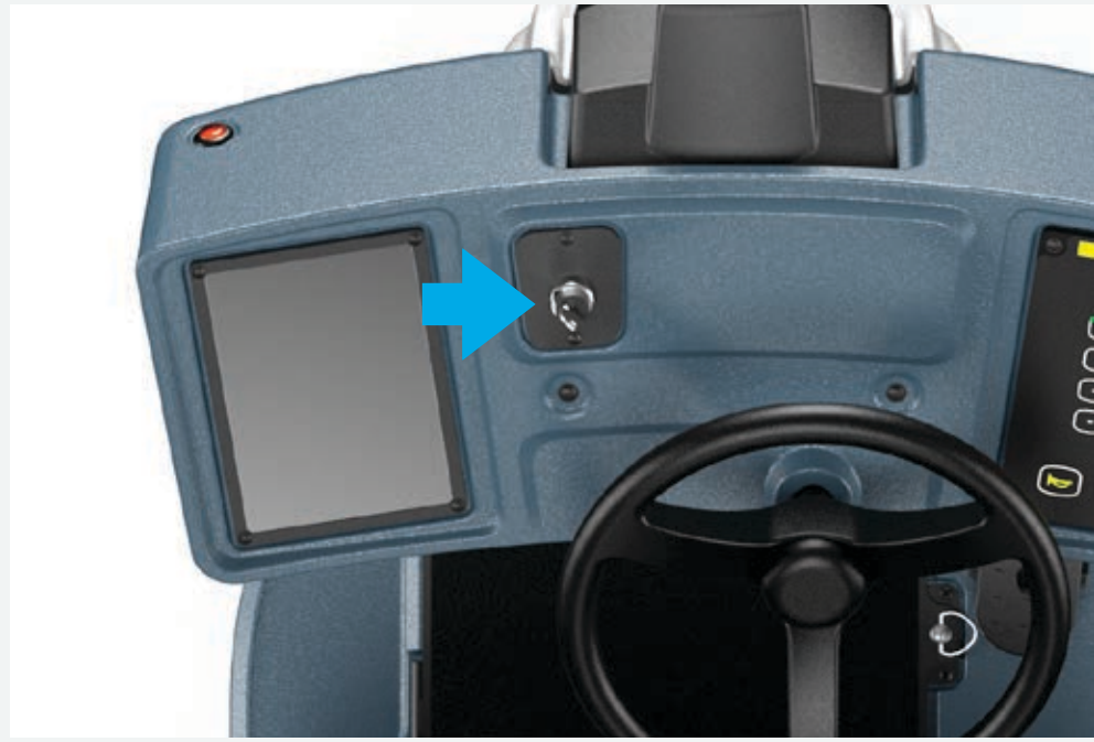
1 Place the key on the machine and turn it on