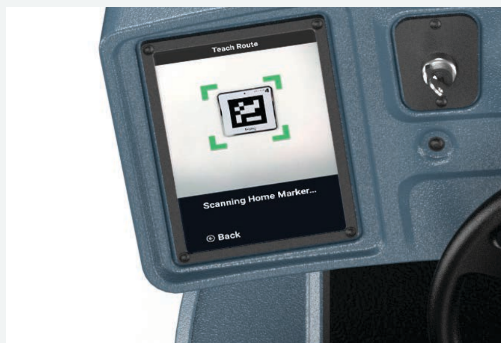
5 SC60 Home marker scanning