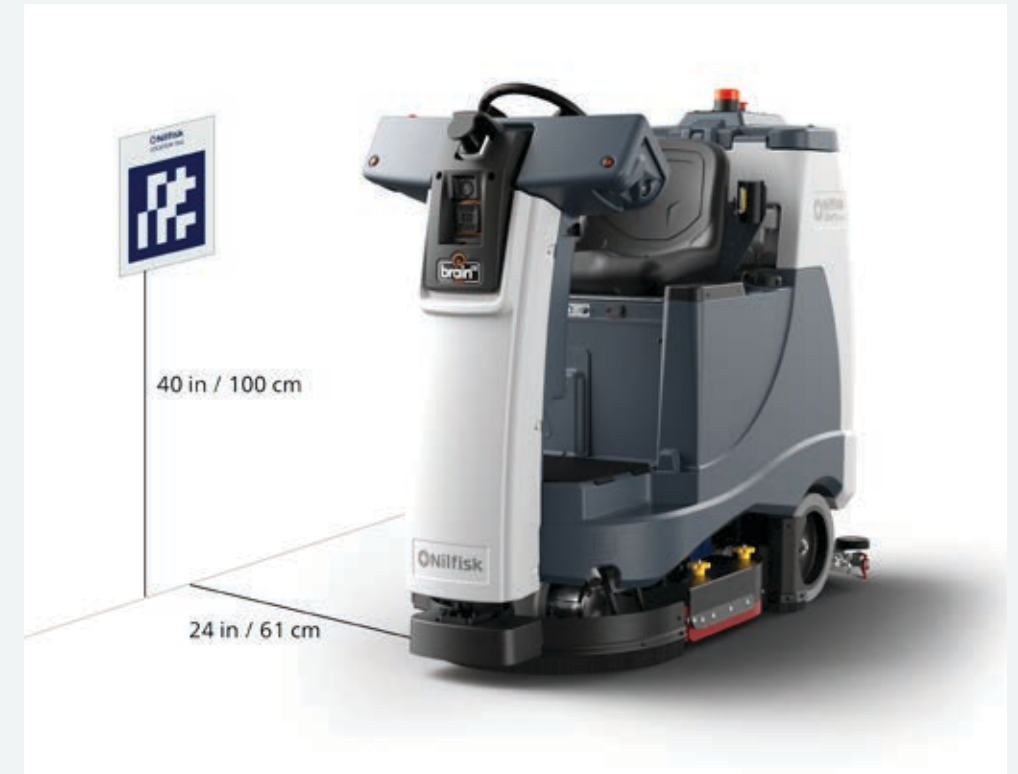
3 Position the right side of the machine close to the Home marker (61 cm)