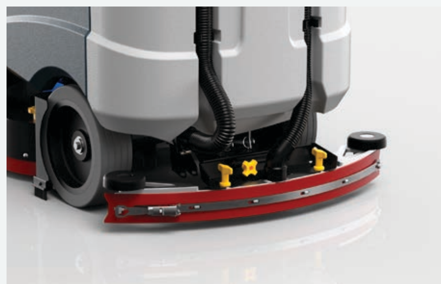
5 Clean the squeegee if needed