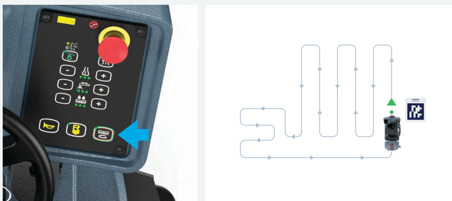
7 Before starting recording the plan press the One touch™ and adjust the cleaning setting