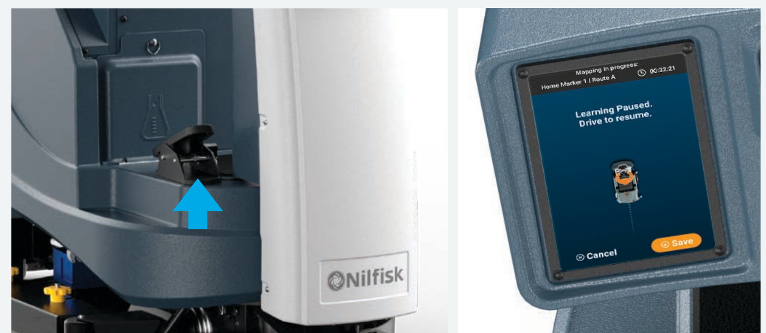
8 You can pause the recording by simply releasing the drive pedal