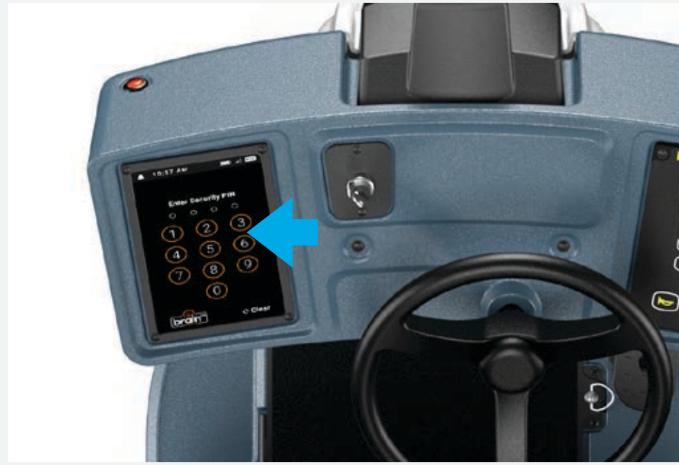
2 Insert the passcode on the touchscreen (1337)