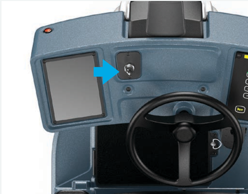
1 Place the key on the machine and turn it on