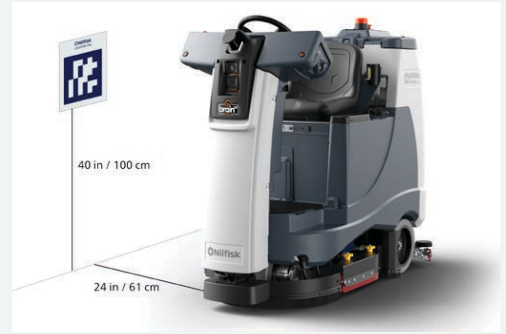
3 Position the right side of the machine close to the Home marker (61 cm)