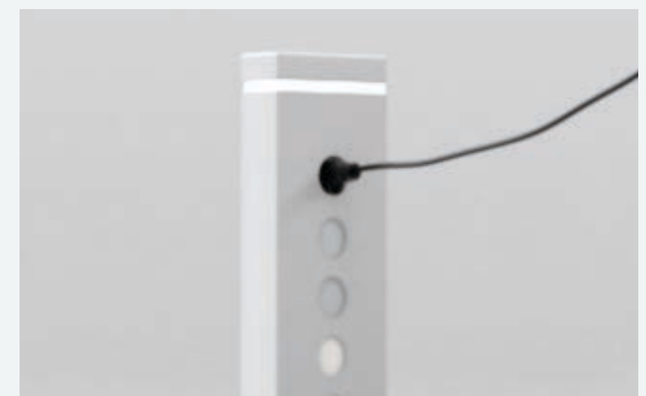
6 Charge the machine for 8-10 hours