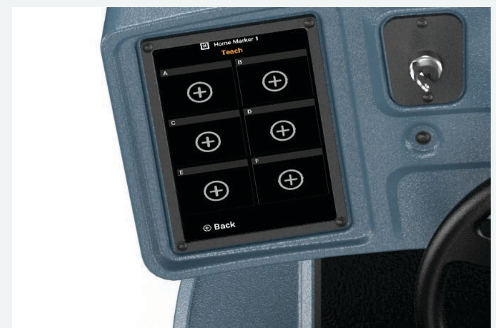
6 Select the slot where you want your cleaning plan to be saved