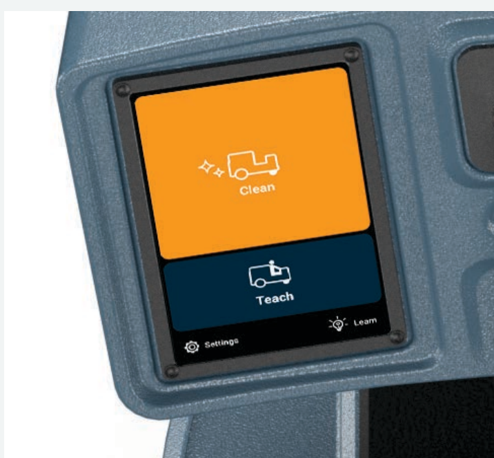
4 Select Clean and follow the instructions on the touchscreen