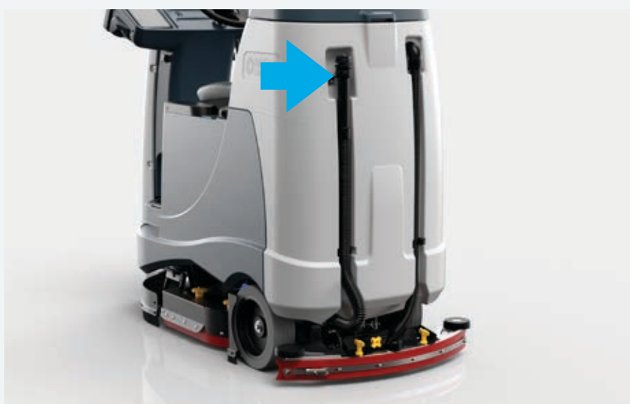
4 Empty the dirty-water tank with a hose, and gently rinse the tank