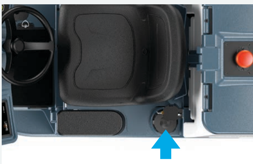
1 Open the cap and Fill the machine with cold water