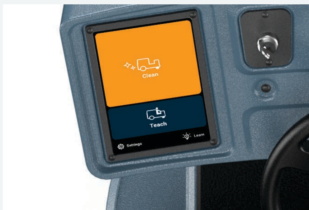
4 Select teach and follow instructions on the touchscreen