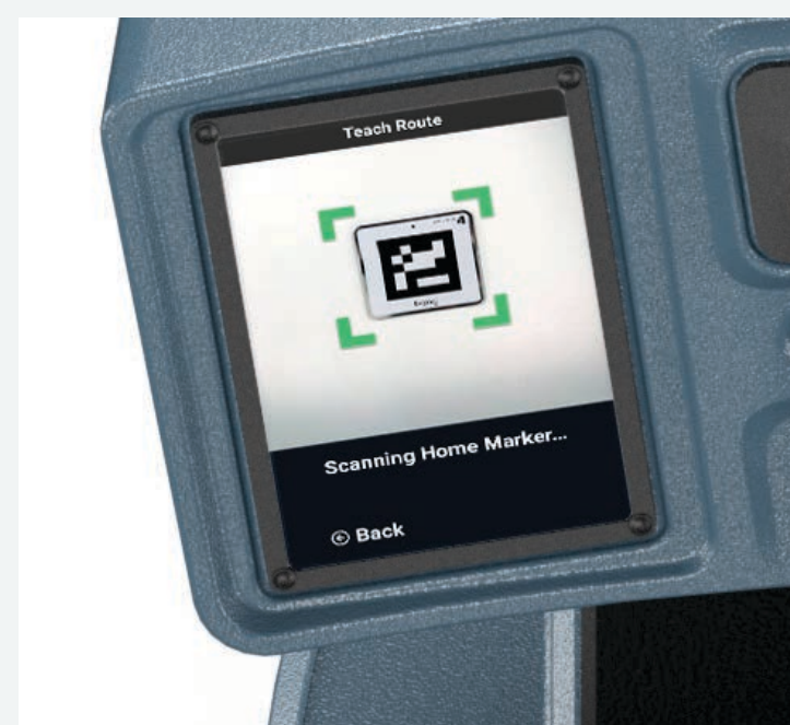
5 SC60 Home marker scanning