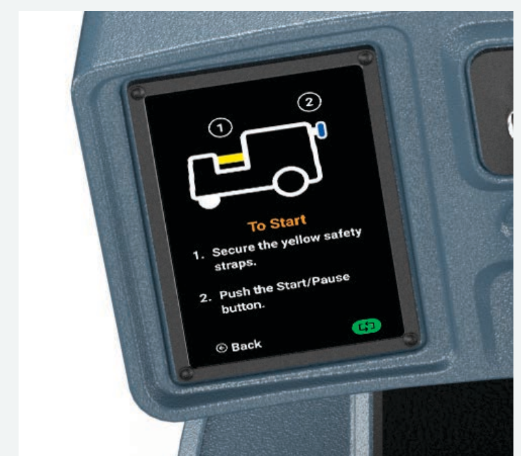
7 Follow the instructions on the touchscreen to secure the unit and start the cleaning plan