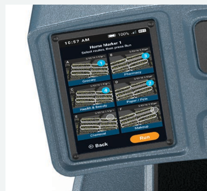
6 Select and decide the order of cleaning plans that you want to run, they will run consequently