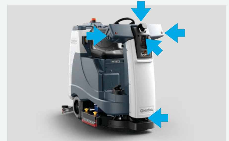
3 Wipe all sensors with a clean microfiber cloth