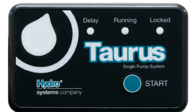
Step 4.1: Press and hold START button for 10 seconds