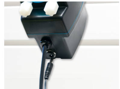
Step 3.2: Plug adapter into pump