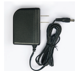
Wall-Mounted Transformer (100-240 VAC) P/N 10096229