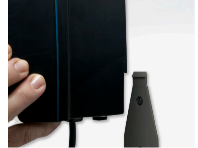
Step 1.1: Slide pump down onto mounting bracket

Desconecte toda la corriente eléctrica al dosificador durante la instalación, servicio y / o siempre que se abra el gabinete de la bomba.