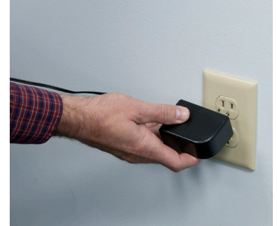
Step 3.1: Plug wall transformer into AC outlet