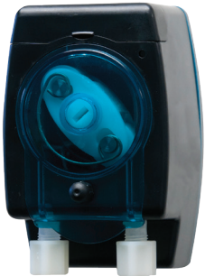
Taurus CP-300 Pump, Complete P/N 00-08879-00, (Includes Cat 5e Cable)