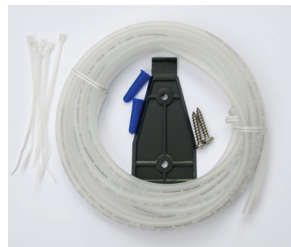
Wall Mount Kit P/N 13-08607-00