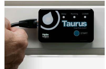
Step 1.4: Connect Cat 5e cable to remote