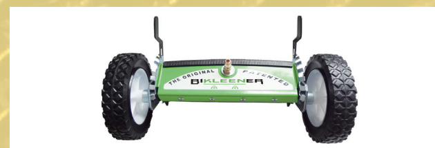
BiKleener – 2100473