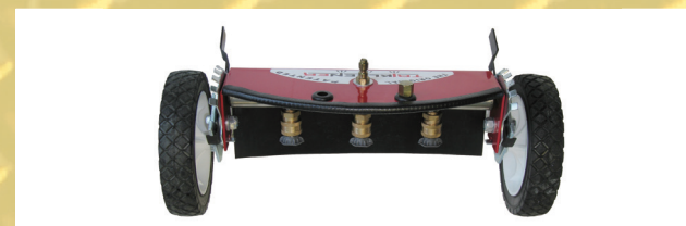
BiKleener – 2100306