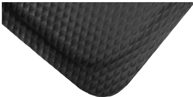
Hog Heaven with black border

Can be customized with your logo, design, or message (see Hog Heaven Impressions)